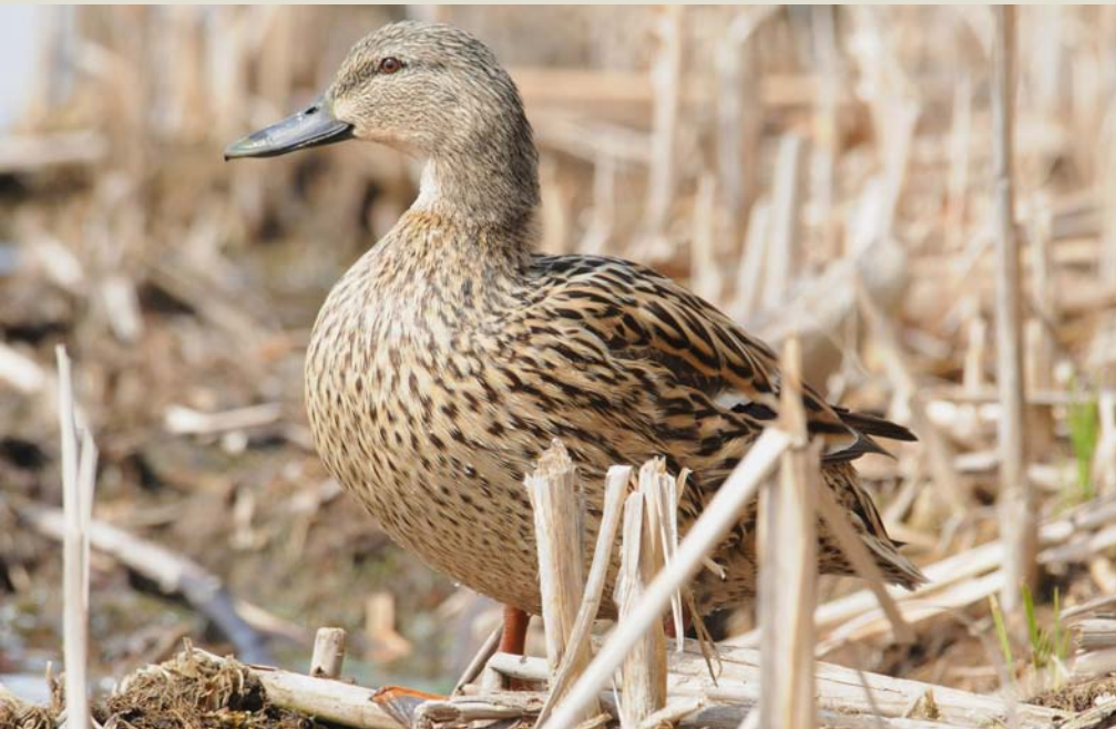
Healthy wetlands attract nesting and migrating waterfowl.