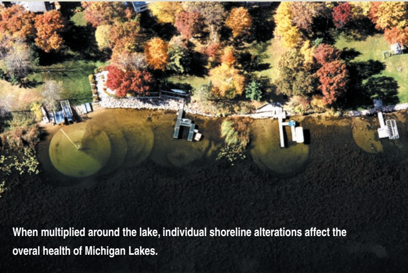
When multiplied around the lake, individual shoreline alterations affect the overall health of Michigan Lakes.

It's like walking in a garden. If a neighbor kid came through once, that would be no big deal but if the whole neighborhood came through, the garden would be trampled.